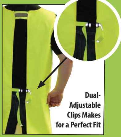
Dual-Adjustable Clips Makes for a Perfect Fit