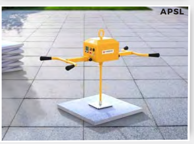
^{*3.1"} x 4.7" pad is included. 4.7" x 8.7" and 6" pad are special order