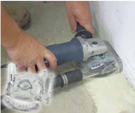
ECOGUARD G SERIES

LEARN ABOUT NEW PRODUCTS AND FIND SOLUTIONS TO WORK EFFICIENTLY