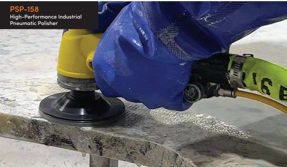
PSP-158 High-Performance Industrial Pneumatic Polisher