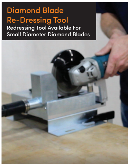
Diamond Blade Re-Dressing Tool Redressing Tool Available For Small Diameter Diamond Blades