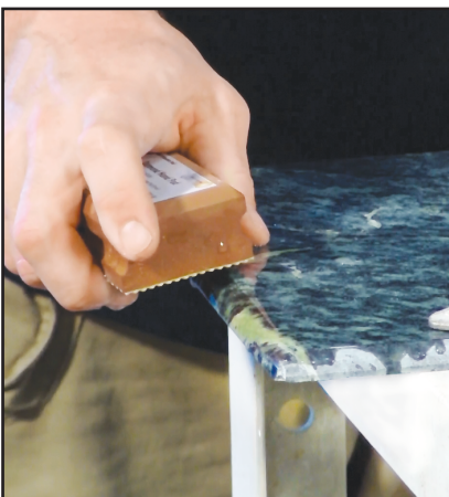
Convenient, On-site Polishing DIAMOND HAND PADS