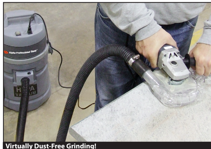
Virtually Dust-Free Grinding! SPIKE DISC, ECOGUARD G & HEPA VAC