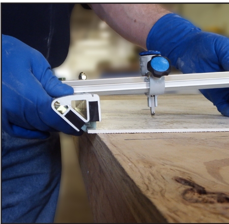
Fast & Accurate Cutting Tools EZ THIN TILE CUTTERS

LEARN ABOUT NEW PRODUCTS AND FIND SOLUTIONS TO WORK EFFICIENTLY