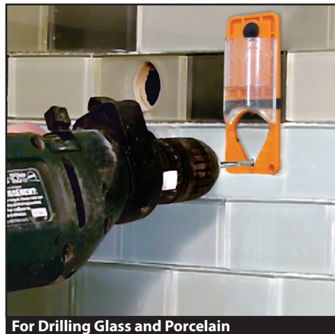
For Drilling Glass and Porcelain ELECTROPLATED DRILL BITS