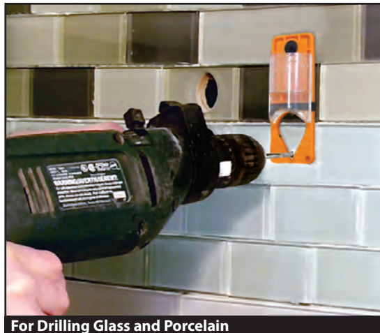
For Drilling Glass and Porcelain