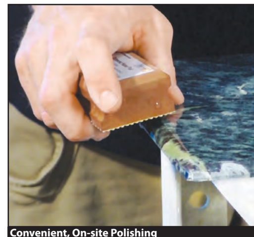
Convenient, On-site Polishing