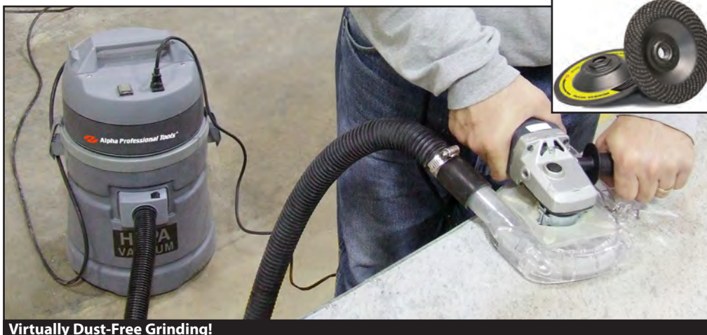
Virtually Dust-Free Grinding!