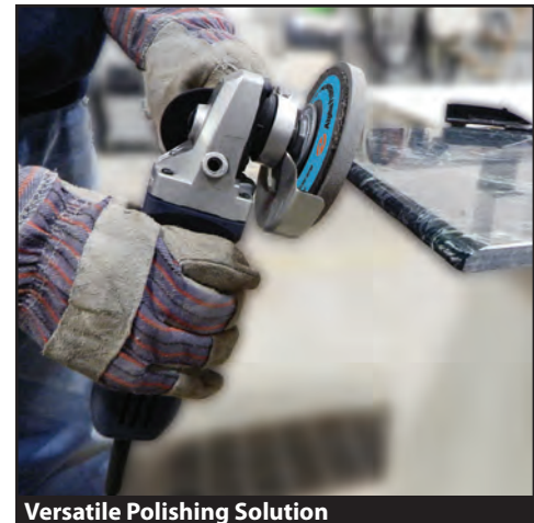
Versatile Polishing Solution