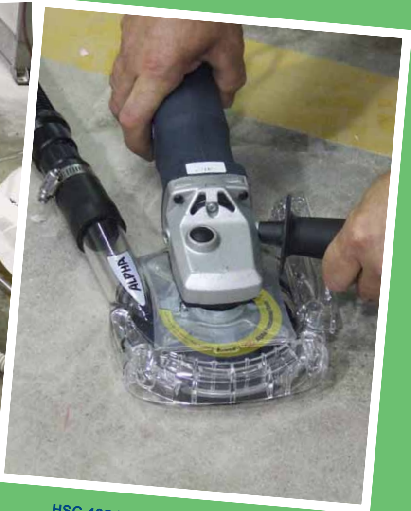
HSG-125 / SPIKE / ECOGUARD TYPE G