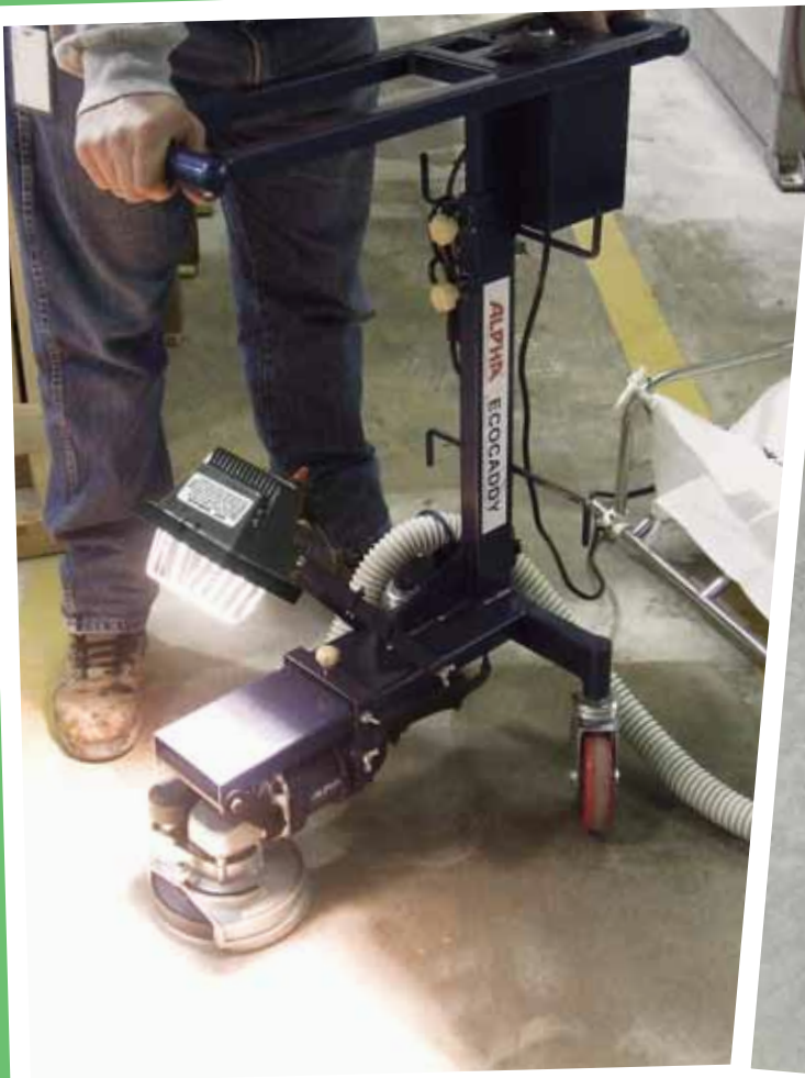
ECOGRINDER / ECOCADDY