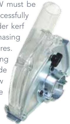
Ecoguard Type W

Alpha® introduces the Ecoguard Type W. Unlike the Ecoguard Type C which uses a supplied dust collection bag, the Ecoguard Type W must be used with a vacuum, or other dust collection system, to successfully collect the dust and larger particles derived from using wider kerf diamond blades such as the Alpha® Tuck Pointing or Crack Chasing blades. The Ecoguard Type W includes three unique features. First is the ability to easily adjust the cutting depth by using a simple wing nut operation. The second is the nose guide that indicates the cut line and the third is the ability to view inside the cover, while cutting, due to the clear polycarbonate material construction. This feature is quite useful during Tuck Pointing applications.