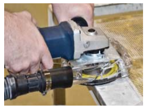
ECOGUARD TYPE M (Spark Protection Cover)

ECOGUARD TYPE G + SPIKE DISC (Mesh Removal)