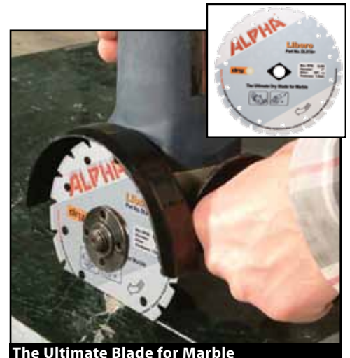
The Ultimate Blade for Marble