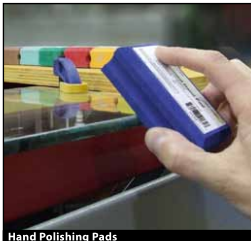
Hand Polishing Pads