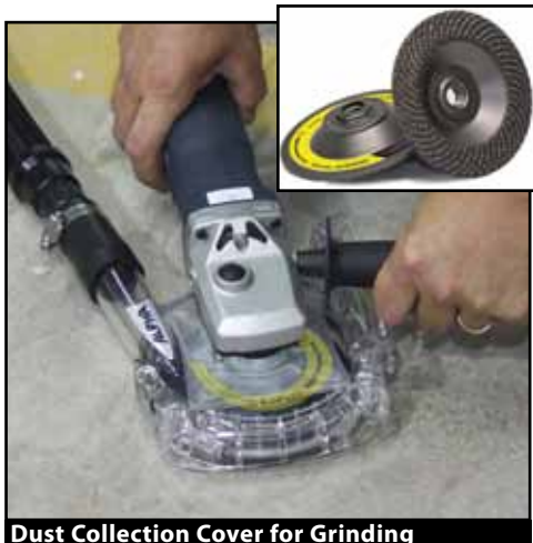
Dust Collection Cover for Grinding