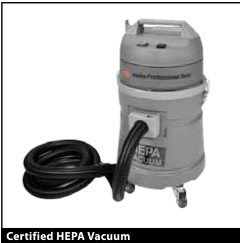
Certified HEPA Vacuum

LEARN ABOUT NEW PRODUCTS AND FIND SOLUTIONS TO WORK EFFICIENTLY