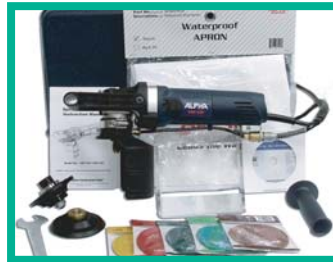
Tile Bullnose Kit