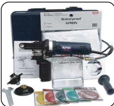
Tile Bullnose Kit