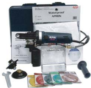
Tile Bullnose Kit

Katana Blade - Cut all materials with the amazing Katana Blade!