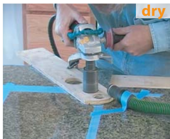
Core Drill Bits