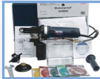
Tile Bullnose Kit