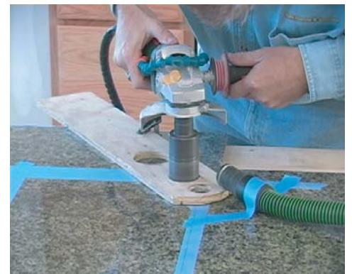
Dry Core Bits