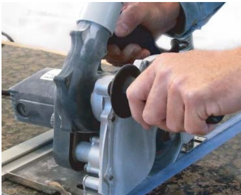
Ecocutter - ECC-125