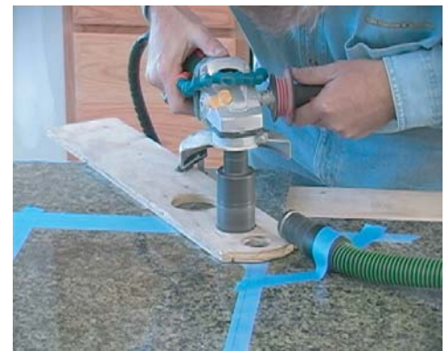
Dry Core Bits