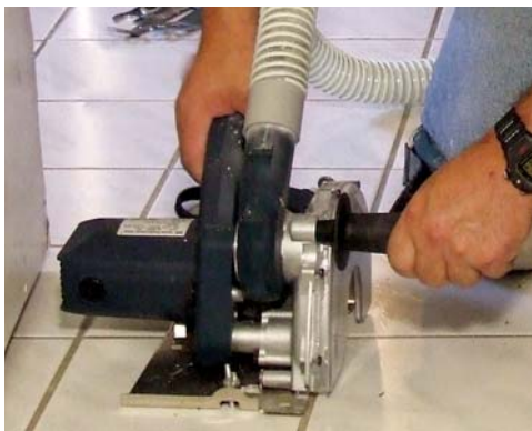
Ecocutter - ECC-125