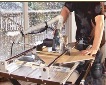
Ecocutter Dry Tile Cutting System

Tile Bullnose Kit - Learn to create a quality finish without the factory using the all new Alpha® Tile Bullnose Kit!