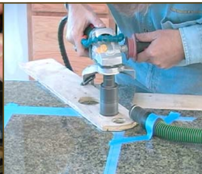
Dry Core Bits