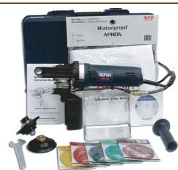
Tile Bullnose Kit