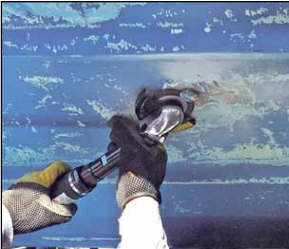
Pneumatic Extended Cut-Off Tool COTE-04 & ULTRACUT ABM SERIES

LEARN ABOUT NEW PRODUCTS AND FIND SOLUTIONS TO WORK EFFICIENTLY