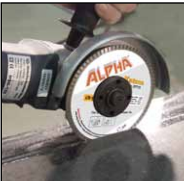
The Ultimate Dry Blade for all KATANA BLADE