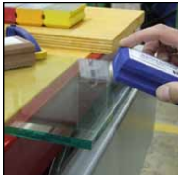
Hand Polishing Pads DIAMOND HAND PADS