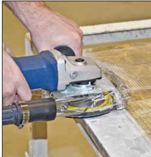
Dust Collection Cover for Grinding ECOGUARD TYPE G & SPIKE DISC