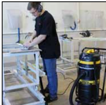
HEPA Wet/Dry Vacuum 15gallon WET/DRY HEPA VACUUM