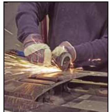
Pneumatic Reversible Cut-Off Tools COTR-03