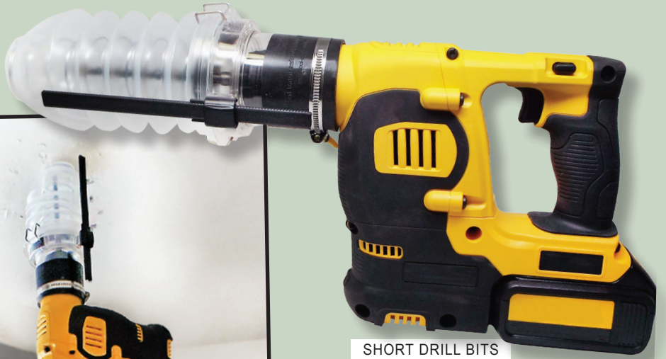
SHORT DRILL BITS