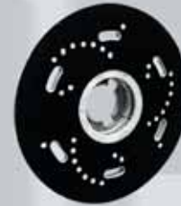
Driver Pad (AD17PAD)