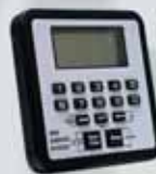
Digital Timer (ADTIMER)