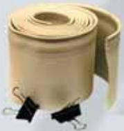
Splash Guard (AD17SPG)