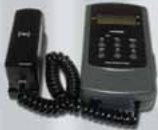
Gloss Checker (IG-331)