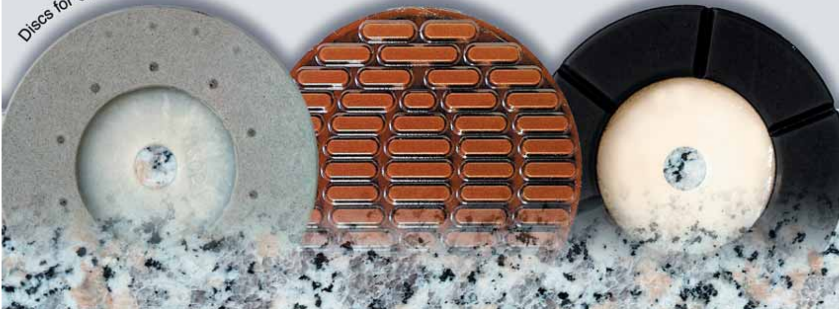
Discs for Granite