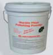
Polishing Powder (ADM5x10) (ADM5x50)