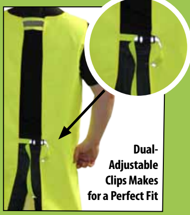
Dual-Adjustable Clips Makes for a Perfect Fit