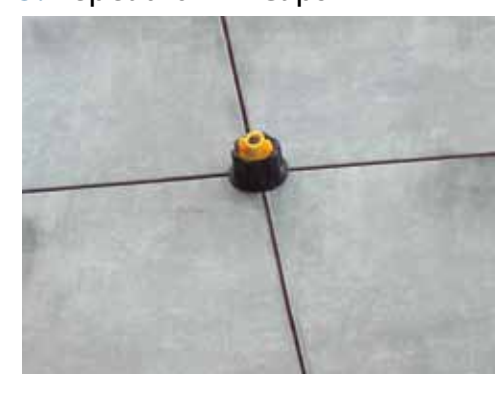
7. Unlock Yellow Cap, Discard the Screw and Reuse Cap