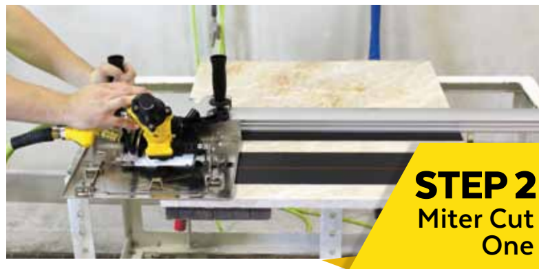
STEP 2 Miter Cut One