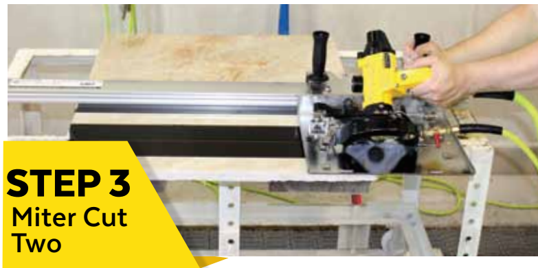
STEP 3 Miter Cut Two