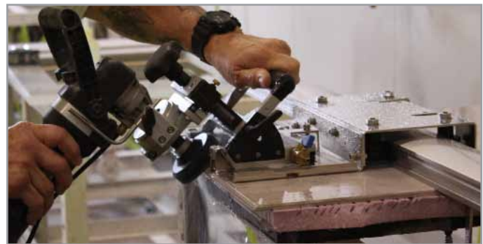
BEVELING AUXILIARY BASE & GUIDE RAIL SYSTEM