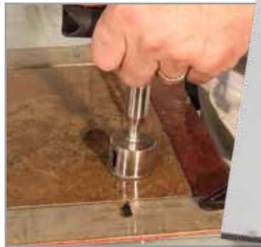
ELECTROPLATED DRILL BITS