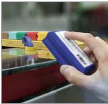
DIAMOND HAND PADS