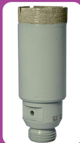
CNC CORE BIT