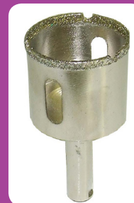
ELECTROPLATED DRILL BITS