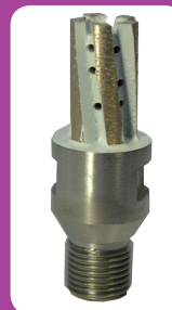
CNC FINGER BIT