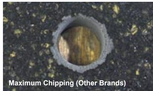
Maximum Chipping (Other Brands)

Alpha ® introduces a Wet Core Drill Bit for CNC Machines and Radial Arm workstations. This Core Bit comes with a 1/2" Gas Thread, designed for the tool holder. The diamonds and matrix have been selected to minimize blow-out at the bottom of the stone, since most CNC Router fabrication is done upside-down. This new Core Bit utilizes the superior technology that has made the Alpha ® Wet and Dry Core Bits the best in the industry.