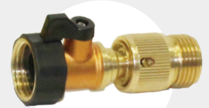
Water Quick Coupler w/ Shut-Off Valve