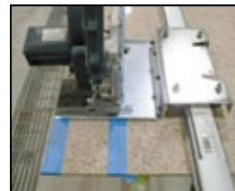
Blade mounted facing Guide Rail.

Distance from Guide Rail to cut line: 11 inches.