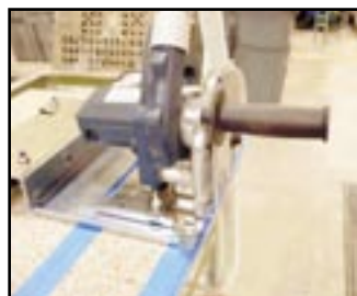
Blade mounted facing away from Guide Rail.

Distance from Guide Rail to cut line: 11 inches.