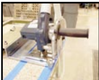
Blade facing away from Guide Rail