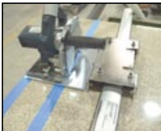
Blade facing towards Guide Rail

ECC-125 can be mounted onto the ECO-CAM in two directions: