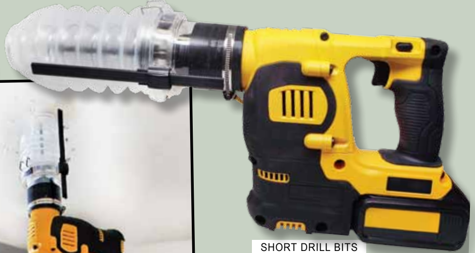
SHORT DRILL BITS